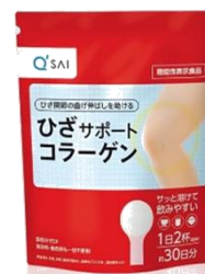
Food with functional claims "Knee Support Collagen"