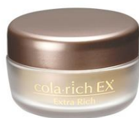
All-in-one cosmetics "Cola-Rich"