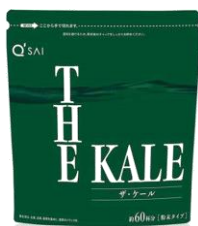
Kale Aojiru juice using Japanese grown kale "The Kale"