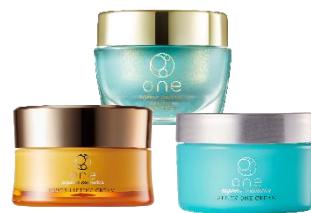
Euglena cosmetics "one"