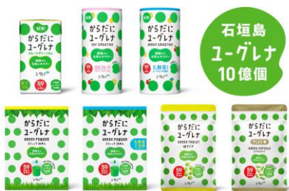
Euglena food "Euglena for the body"

Euglena Co. is a venture company originating from the University of Tokyo that sells health foods and cosmetics using the microalgae Euglena , and was the first company in the world to succeed in the outdoor mass cultivation of Euglena for food usage. It also conducts research and development on biofuels and feed. Since listing on the First Section of the Tokyo Stock Exchange in 2014, it has achieved rapid growth centered on the mail-order business for health foods and cosmetics, while also promoting businesses in the sustainability area, such as biofuel R&D and demonstration manufacturing and support for Bangladesh. In August 2020, the 15th anniversary of the Company's founding, it revamped the Corporate Identity (CI) and established "Sustainability First" as the Euglena Philosophy. For more information, see https://www.euglena.jp/ website.